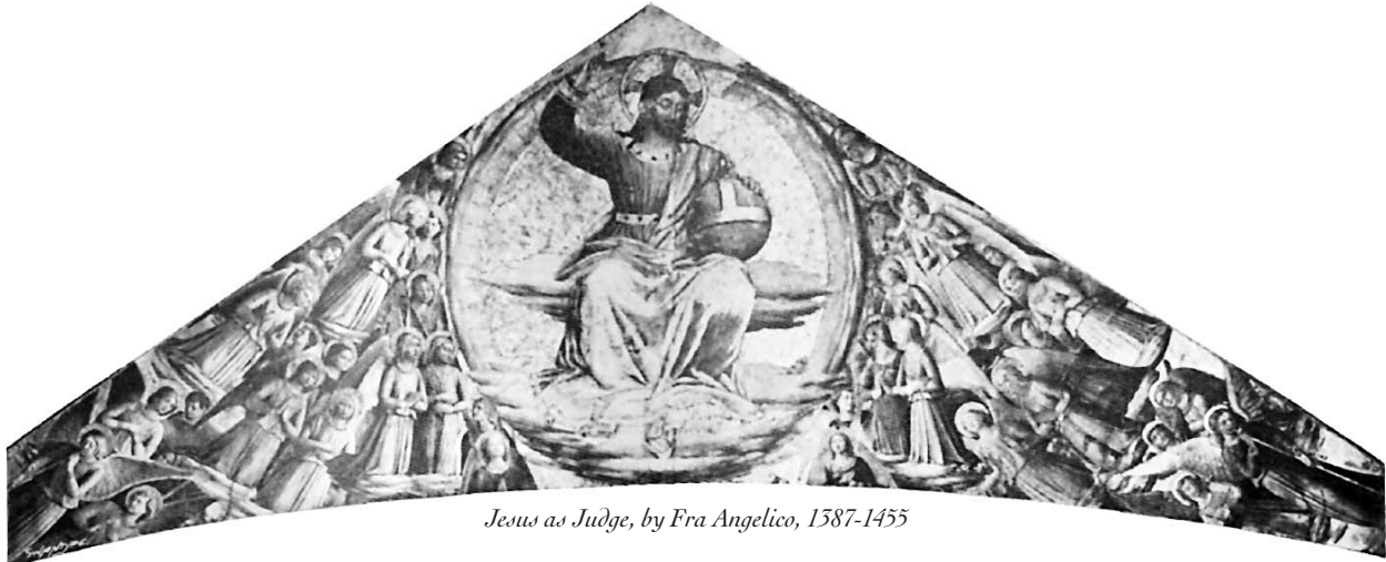
Jesus as Judge, by Fra Angelico, 1387-1455

"Jesus' Resurrection is the definitive proof of his divine authority."