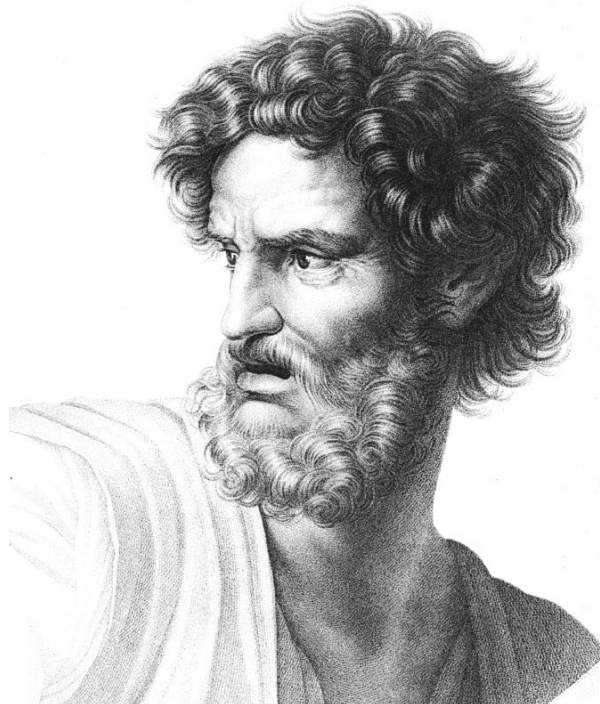
Simon the Cyrenian, by Ferréol Bonnemaïson, 1766-1826, after a painting by Raphael

"As long as we refuse to give in to the temptation, there is no sin."