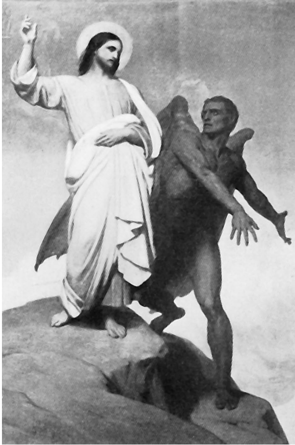
The Temptation of Christ, by Ary Scheffer, 1795-1858

only Son, that whoever believes in him should not perish but have eternal life" (Jn 3:16). The third meaning of "the world" refers to everything about human life and society that is in any way opposed to God.