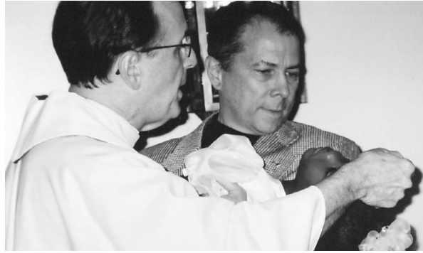
Baptism of a young child

The Blessed Trinity, three persons in one God, is a profound mystery. Because it reveals who God is in his inmost being, the mystery of the Blessed Trinity “is the central mystery of Christian faith and life” (CCC 234; italics added). This mystery is not illogical,