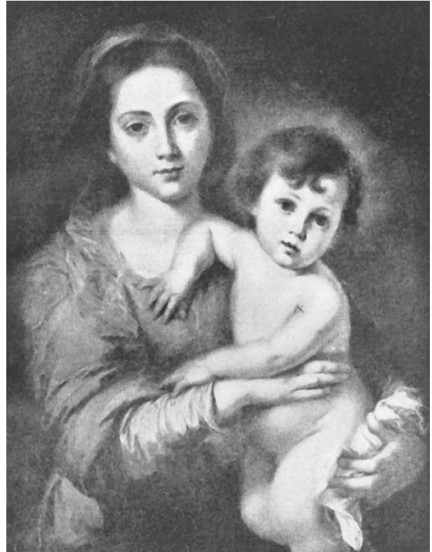
Madonna and Child, by Bartolomé Murillo, 1617-1682

Why did the second person of the Trinity assume human nature? It was 1) to save all men and women from their sins and to reconcile them to God (see 1 Jn 4:10,14); 2) so that all men and women will know God’s love (see Jn 3:16); 3) to model holiness and the