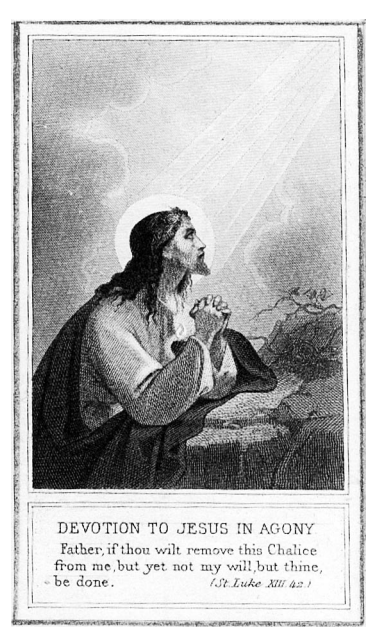
Jesus prays in the Garden of Gethsemane

This type of heresy, like the heresies that denied Jesus' humanity, arose by the end of the 1<sup>st</sup> century. The first was the assertion that he was only a man on whom the Holy Spirit came to rest at his baptism (Ebionism). In the 2<sup>nd</sup> and 3<sup>rd</sup> centuries, a variation