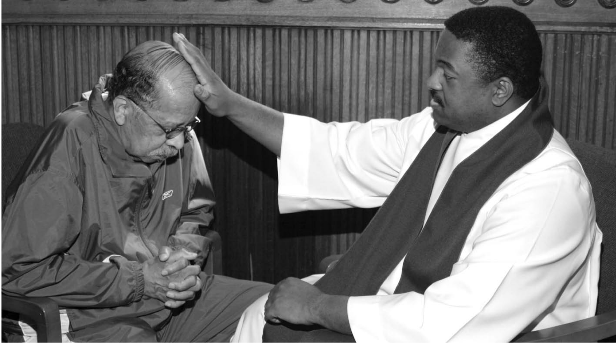
Reconciliation is a sacrament of mercy and bealing

Proper reception of the sacrament provides sac-