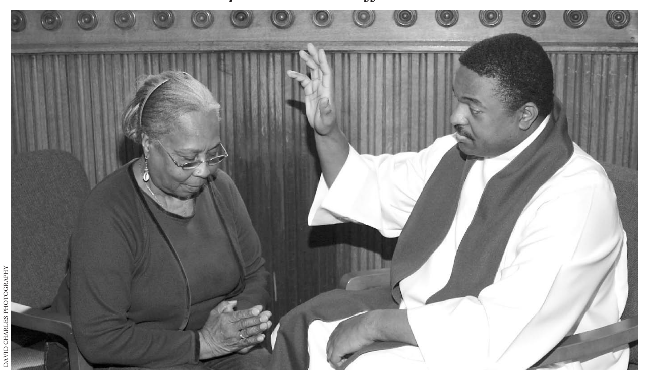
Absolution is given to a penitent by a priest in the name of the Father, and the Son, and the Holy Spirit