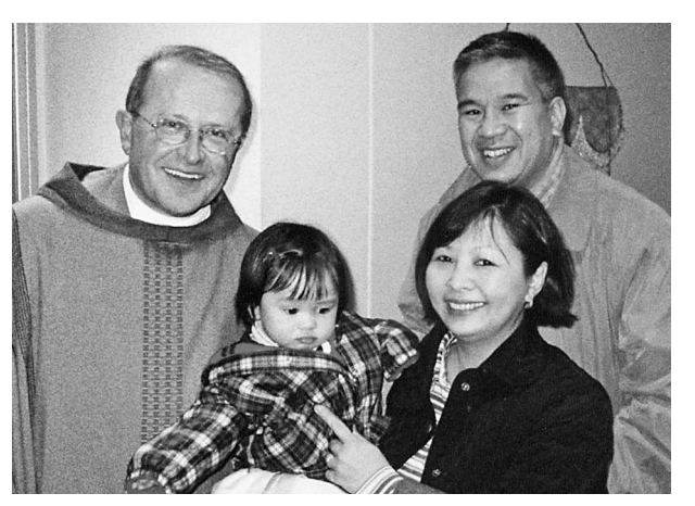
"The Catholic family shows us the priesthood of the laity in a domestic church."

A Catholic calendar allows the family to be aware of approaching feasts. Children's imagination and creativity can be drawn upon to prepare for feasts such as Christmas, Easter, and Pentecost. Advent wreaths and Advent calendars heighten the awareness of all family members to the coming of the Babe of Bethlehem. Children can be taught very early to pray more, practice voluntary penances, and give alms during Lent. Even Halloween — which in reality commemorates the Feast of All Saints ("All Hallows") — and Thanksgiving lend themselves to the creating of Godcentered family traditions. Children can be encouraged to create and care for an outdoor shrine to the Blessed Virgin or a special saint. Family outings can include pilgrimages to churches and shrines.