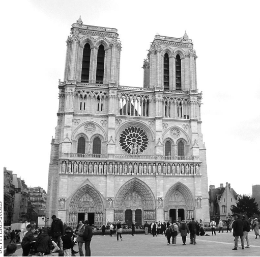
Cathedral of Notre Dame (Our Lady) in Paris, France, built between 1165 and 1255

es of God, on sacred vessels and vestments, walls and panels, in houses and on streets” 2 (CCC 1161). The Council went on to say that those who look at images are reminded of, and love more ardently, those depicted, and that true adoration is to be given to God alone. With the coming of Protestantism, iconoclasm flowered again. There was a great destruction of images in Catholic churches all over Europe, and to this day many Protestant churches are unadorned with images, or use them sparsely.