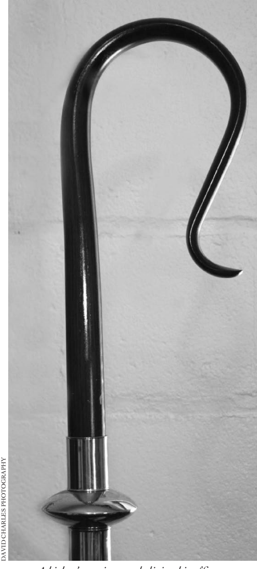
A bishop's crosier, symbolizing his office of shepherd of Christ's flock

Since our Lord intended to be with us until "the close of the age" (Mt 28:20), the apostles needed to