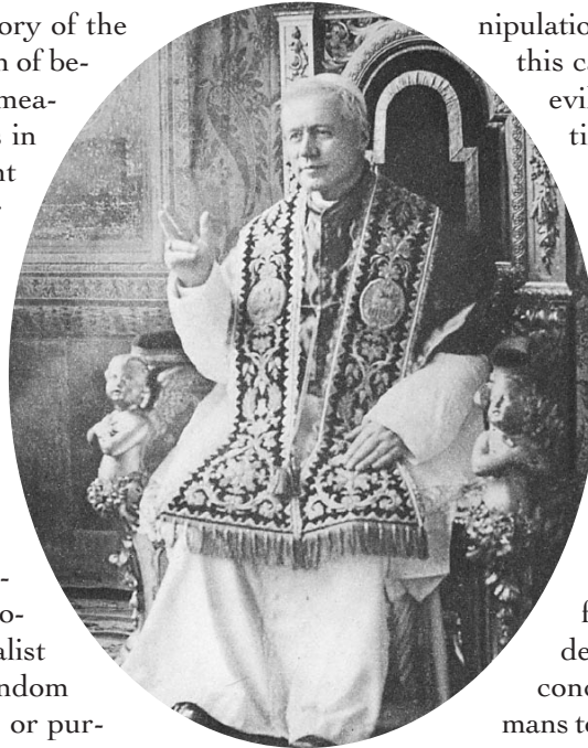
Pope St. Pius X, reigning from 1905 to 1914, sought to combat the rapidly spreading errors and excesses of the secular mindset

Those who have no solid basis for their "values" fall prey to one of the most devastating errors of our contemporary culture: the belief that the purpose of an action can alone make it good. In older terminology, this was called the belief that the "end justifies the means." All the evils of abortion and ma-