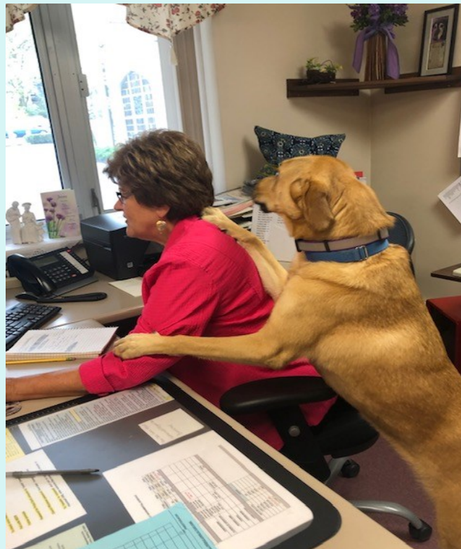
Ossa is helping at the front desk!