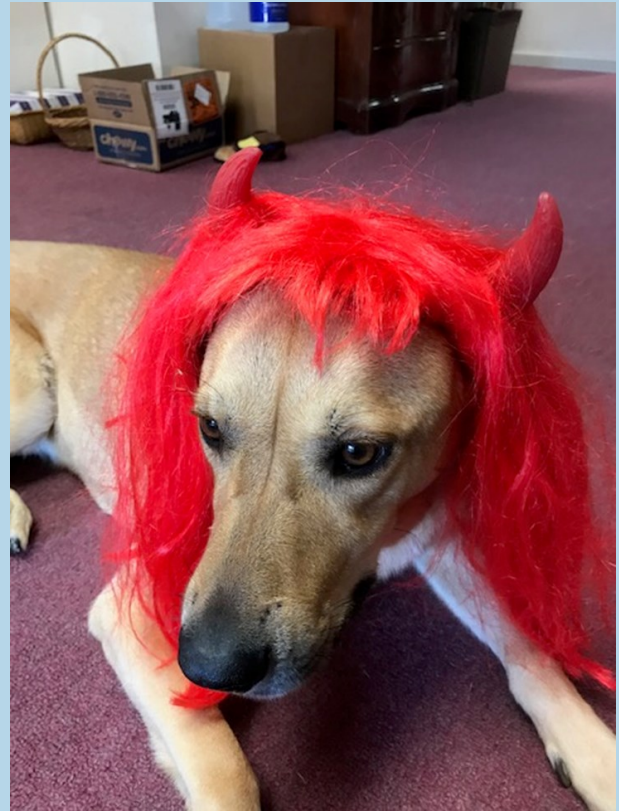
The devil made me do this when I was a Pup!