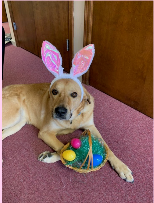
Some "Bunny" loves you!