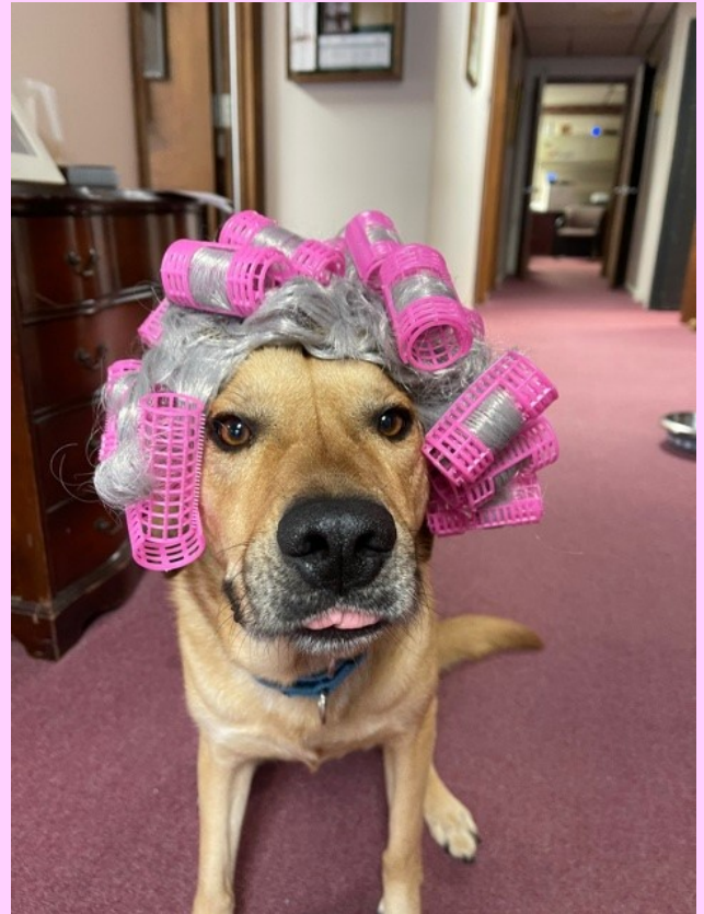
Who says "girls" don't look cute in curlers!