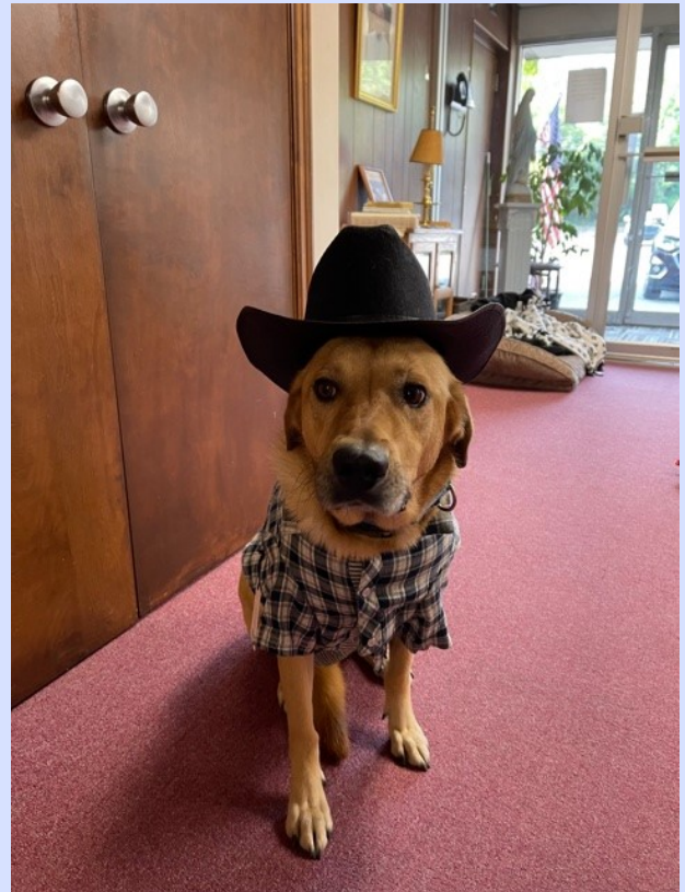
Ossa is going country!