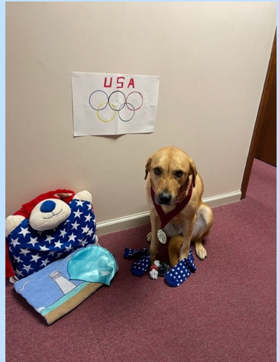
Ossa won a "Gold Medal" in the Doggie Olympics