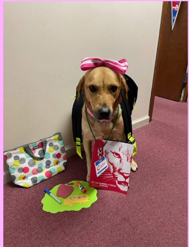
Ossa is ready to start school! She wants everyone to stay safe!