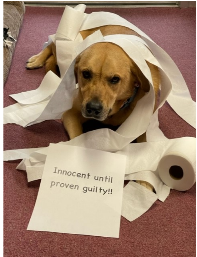
Just another day at the Parish Center!