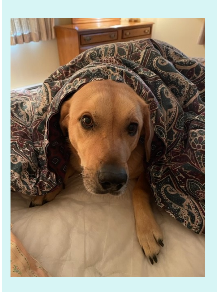
No sleeping on the floors when Dad is away!